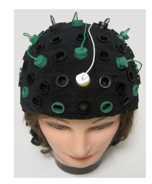
Fig. 4. EEG configuration for recording

A common protocol used for non-invasive BCIs is related to P300 evoked potentials. Most applications based on P300 use a paradigm in which the user faces a screen that may contain letters, numbers or different commands. Each symbol flashes for a number of times chosen before. The user makes a selection by counting each time the symbol flashes. In order to decide which symbol was chosen by the user, different algorithms are used. Usually, P300 applications do not require initial training for the user. The typical communication rate is of about one word (i.e. 5-6 letters) per minute, but the improvement in the ability to select letters faster triggers an increase in the communication rate. Many ALS suffering patients are using this new spelling machine. One remarkable case is