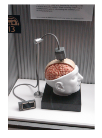
Fig. 2. Dummy image of BrainGate presented at an exhibition [27]

Recent work of the same research team has been focused on using the robotic arm in order to control some objects in the environment. They replaced the gripper at the end of the robotic arm with a three fingers control system. This system was controlled using the recorded signals in the