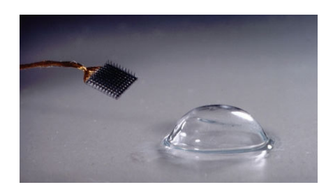
Fig. 3. Image of electrodes array [28]

among the patients who volunteered for using the BrainGate system. She is paralyzed and unable to speak, but her brain is sharp. She succeeded to control a cursor on a screen and she is able to operate a computer program for writing, checking emails, navigating on internet and she can even control her wheelchair.