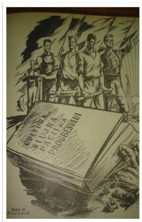
Flacăra (1948) on the appropriation of culture by the political ideologies: “Culture in service of peace and progress”.

explain in a schematic, wooden language, all levels of reality. Culture was meaningless – within this system – unless it had a function ( The function – to legitimise and “serve” power). It was meant just to “show” the communist reality (usually a stereotypical description of utopian characters and facts – constructed and legitimated themselves by the purpose of “building” a new society and the “new man”) and embody ideological principle (class struggle and so on), following a Marxist background. “Marx uses a three-factor notion of ideology, as falsity, role, and isomorphism. For him an ideology is not a new object or symbol, but a way of examining cultural creations along specific dimensions and an attempt to relate these creations to a specific social base. ” (Huaco, 421-422)