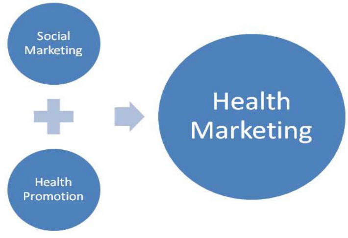
Fig. 1. Health marketing

Health marketing has developed, mainly, from two disciplines: social marketing and health promotion. While both of them have the same general purpose, which is the well-being of individuals and of society, the manner in which they strive to achieve it is rather different. In spite of that, health marketing, as a border-discipline has had tremendous success, when applied properly.