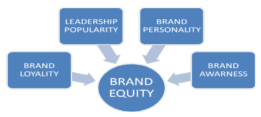
Fig. 1. The brand equity structure( Source 2)

health rarely uses them. Nevertheless the structure is similar for both areas.