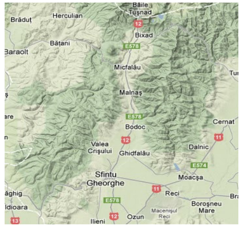
Fig. 1. Research location [17]

- Establishment of forest sites and forest types distribution from the researched territory.