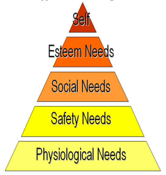
Fig. 2. Motivational hierarchy