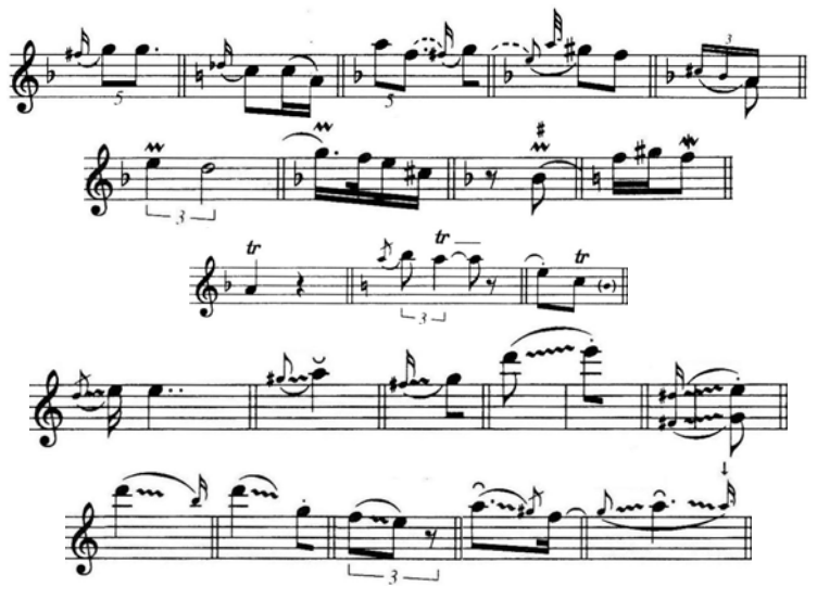
The figurations in movement of sixteenth stereotypical cadences, in the length of one notes are mainly present in the or two bars of 4/4:

Compared with other musicians from Transylvania, Sinka Sándor's violin technique is relatively simple. Among the ornaments used, we can especially mention the appogiattura (ascending or descending, stressed or unstressed, made of one or more sounds), the mordent and the trill (with a higher or lower changing sound, in the case of the higher one at a distance of a tone or a halftone, in the case of the lower one at a distance of a halftone), as well as glissando (before the main sound being mostly ascending and after it usually descending):