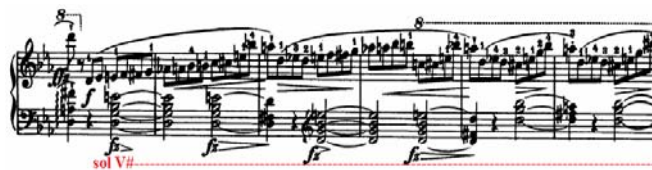
Ex.24. Fr.Chopin – Sonata No.1 Op.4 in C Minor , IV-th part, ms. 72-77

chromatic scale, harmonically supported by the accords of the accompaniment plane constructed on the fundamental of the V-th step from G minor.