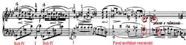
Ex.18. Fr.Chopin – Sonata No.1 Op.4 in C Minor, III-rd part, ms. 27-31

31, through a transitive, enharmonic and chromatic passage, it returns to the initial tonality, A flat major.