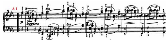
Ex. 12. Fr. Chopin – Sonata No. 1 Op. 4 in C Minor , II-rd part, ms. 17-23

start off and back games in the sphere of the initial tonality. Technically, in the middle period, motives in parallel thirds are used, exposed by register variation and taken over by imitations on small structural units, all these conferring a playful, casual, humoristic character on the musical discourse.