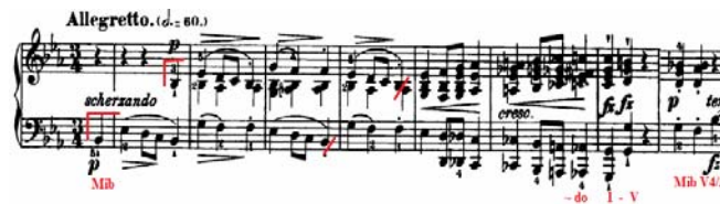
Ex. 11. Fr. Chopin – Sonata No. 1 Op. 4 in C Minor , II-nd part, ms. 1-8

four-measure canon by the higher voice and harmonically wrapped with the other internal voices. On harmonic level, we noticed a modulating inflection towards the tonality of the minor relative, but immediately turned towards the dominant of E flat major.