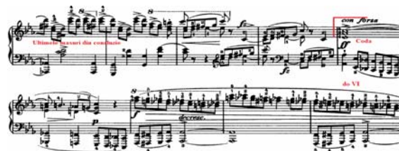
Ex.10. Fr.Chopin – Sonata No.1 Op.4 in C Minor , part I, ms. 235-248

The conclusion contains elements from the exposition and is followed by a coda , marked by the indication con forza , having a character of virtuosity, bravery, through brilliant technical passages, in parallel thirds and octaves, which require an alternative execution of legato – staccato for greater buoyancy of the overall pianistic apparatus.