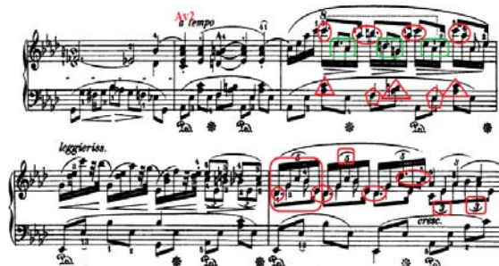
Ex.19. Fr.Chopin – Sonata Nr.1 Op.4 in C Minor, III-rd part, ms. 31-35

two sonorous planes, rhythmically diversified through the insertion of the quintets and triplets overlapping the binary formulas in the accompaniment [1].