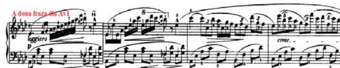
Ex.17. Fr.Chopin – Sonata No.1 Op.4 in C Minor , III-rd part, ms. 21-24