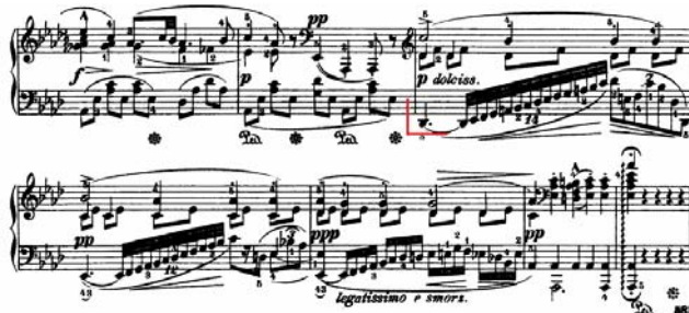
Ex.20. Fr.Chopin – Sonata No.1 Op.4 in C Minor, III-rd part, ms. 36-42

conduct the melodic line to the end. The typical chopinian ornamentation is also present in these last measures, in the grave register, enriching the melodic line destined to the left hand.