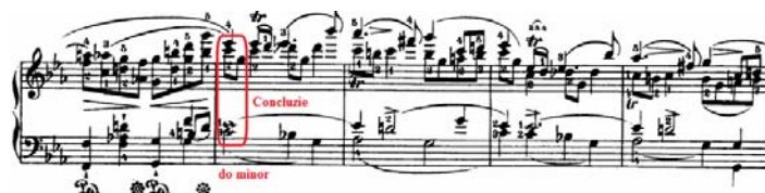
Ex. 5. Fr.Chopin – Sonata No.1 Op.4 in C Minor , ms. 58-62 (first ms. of the conclusion)

end of the exposition. Along the 30 measures, the composer continuously generates numerous variants of the chromatic motive from the main theme, being equally preoccupied with introducing new modulating inflections and with diversifying the pianistic score through the insertion of unprecedented figures (similar to those in Studies Op.10 , that he was to compose a few years later) [1]. The passage towards exposition is briefly, suddenly made through a single accord with function of dominant for the new tonality of the development – A flat major.