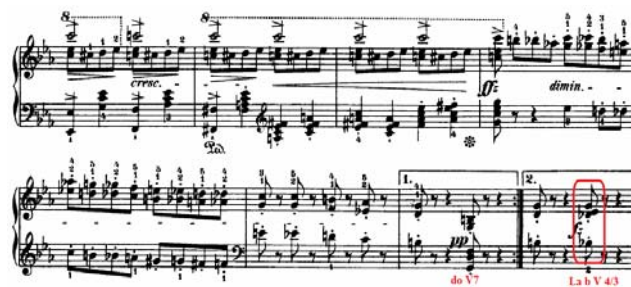
Ex. 6. Fr.Chopin – Sonata No.1 Op.4 in C Minor , ms. 83-89 (ending of the exhibition)