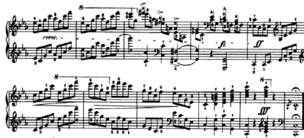
Ex.26. Fr.Chopin – Sonata No.1 Op.4 in C Minor , IV-th part, ms. 389-399