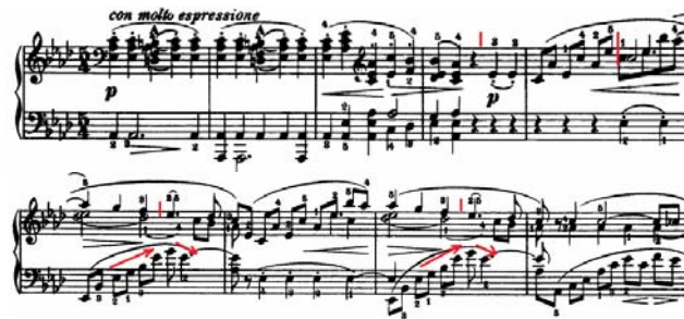
Ex.15. Fr.Chopin – Sonata No.1 Op.4 in C Minor , III-rd part, ms. 1-9

From formal standpoint, the delimitation is difficult, the fluency of the melody impeding the tentative towards fragmentation and rupture of the sonorous flow. Searching beyond this continuity, we discovered however motives and themes that are reiterated several times along the movement, outlining a three-verse form, with variation elements. We notice therefore that three form principles intertwine: the one of verse, the one of variation and the one of freedom to structure treatment (manifested by the asymmetry of the phrases consisting in unequal number of measures).