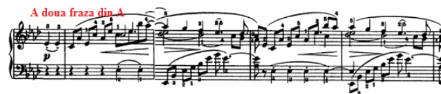
Ex.16 – Fr.Chopin – Sonata No.1 Op.4 in C Minor , III-rd part, ms. 5-8

The second period is marked by the resumption of the musical idea from the introduction in measure no. 14, where we notice the same accords as at the beginning of the part, transposed up an octave and accompanied with arpeggios. This period consists of three asymmetrical phrases, having 7 + 6 + 5 measures. Starting with measure 21 (delimitation moment between the first and second phrase), a new cantilena looms, more richly adorned, of variational aspect with respect to the theme exposed in the first period. In the examples below, we rendered the initial theme, followed by its hypostasis enriched with arabesques in the higher register.