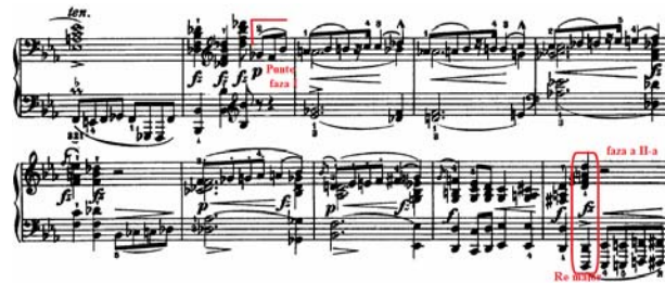
Ex.9. Fr.Chopin – Sonata No.1 Op.4 in C minor , part I, ms. 185-203

B cumulates this time the two themes exposed in the secondary thematic group from the exhibition, in a single structural unit, exposed in G minor and modulating towards A flat major. Near the conclusion, the tonal trajectory moves towards the scope of C minor, returning thereby to the initial basic tonality.