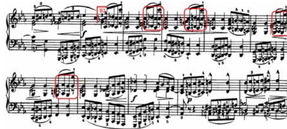
Ex.4. Fr.Chopin – Sonata No.1 Op.4 in C Minor , part I, ms. 42-52

We called this new stage B2, considering it as integrant part of the secondary thematic group. Symmetrically structured in 8+8 measures, this delimitation highlights the preoccupation for dimension equilibrium, the composer searching for every sub-section, an interior form as coherent as possible, with a sense as autonomous as possible.