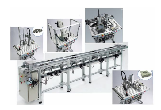
Fig. 2. The layout of processing stations on flexible line FMS 200; ProDD Institut Braşov

• processing station 4: station vision visual inspection by camera type COGNEX DVT515.