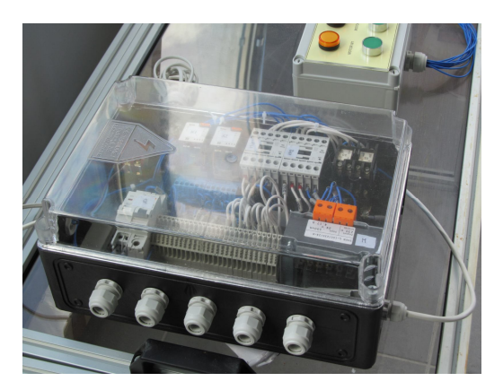
Fig. 3. Electrical module for independent command of conveyor belt engine of flexible line FMS 200

driver. This driver is a 32-bit application for Windows, used as a means of taking data and information from various client devices in industrial applications. KepServerEx fall into the category applications that can be used as OPC server.