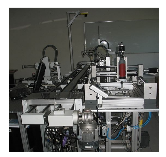
Fig. 1. Flexible processing line - FMS 200 at the ProDD Research Institute; overview

Each processing station is equipped with its own electric panel. Components and devices that compose electrical installation are visible positioned so that, it is possible to add new elements when it is necessary to modify the system. The command of electric and pneumatic actuators is performed with programmable logic controllers (PLC), type Siemens S300.