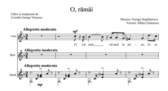
Fig. 2. Graphical representation musical text, George Stephanescu - "O stay" trio, vocals, flute, guitar (Ed. "Artes" - Iași, 2013)

Further specifications are added to the same chapter VI, art. 33, lett. d) "the reproduction for information and research purposes... the integral reproduction of a copy from an oeuvre is permitted, for its replacement, in case of destruction, serious deterioration or loss of the unique copy from the respective archive or permanent collection" [6].