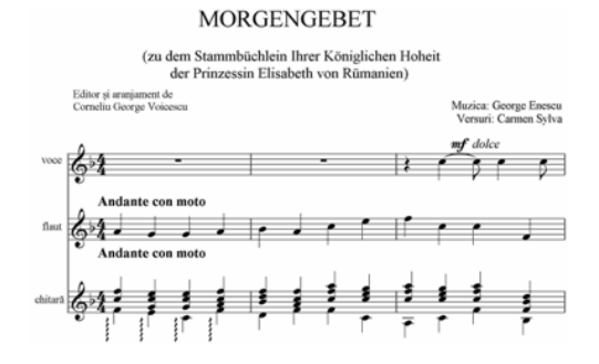
Fig.1. Plot musical text, George Enescu, "Morgengebet" transcription trio: voice, flute and guitar, (Ed. "Artes" - Iași, 2013)