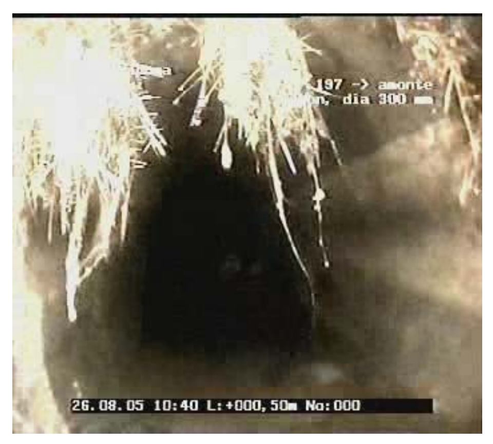
Fig. 5. Early stage of roots penetrating inside concrete sewer pipe [2]