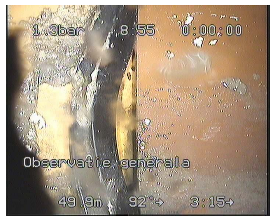
Fig. 3. Rubber gasket expulsed from groove in a PVC pipe joint