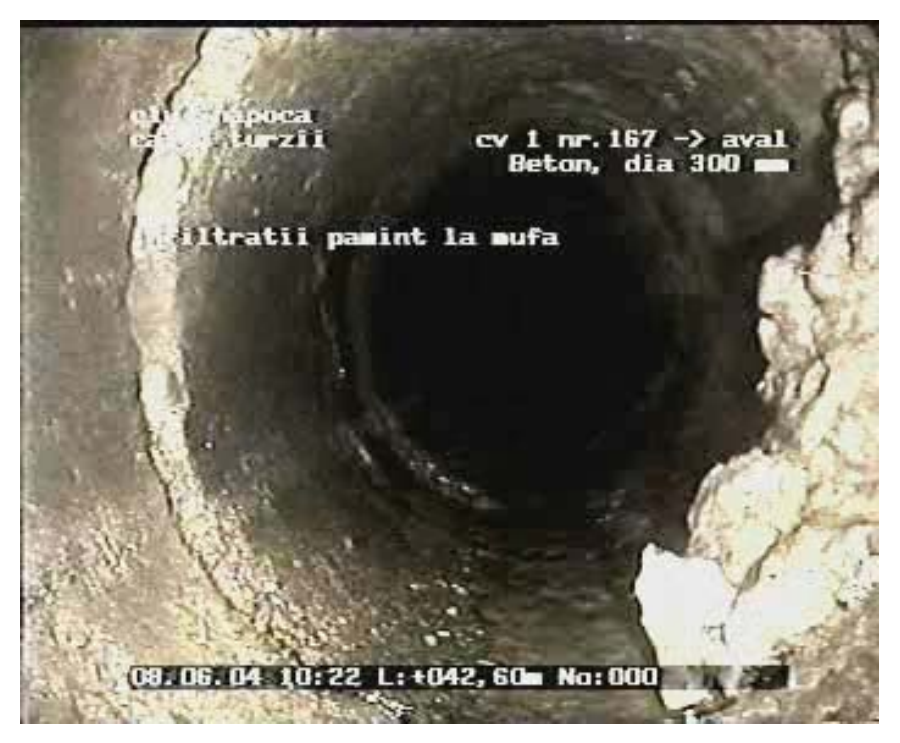
Fig. 2. Faulty joint in a concrete sewer section allowing soil to enter inside the pipe (in the right side of the image)