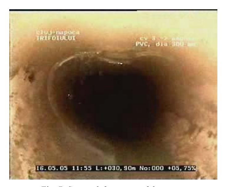
Fig. 7. Severe deformation of the pipe cross section – the sealing is compromised