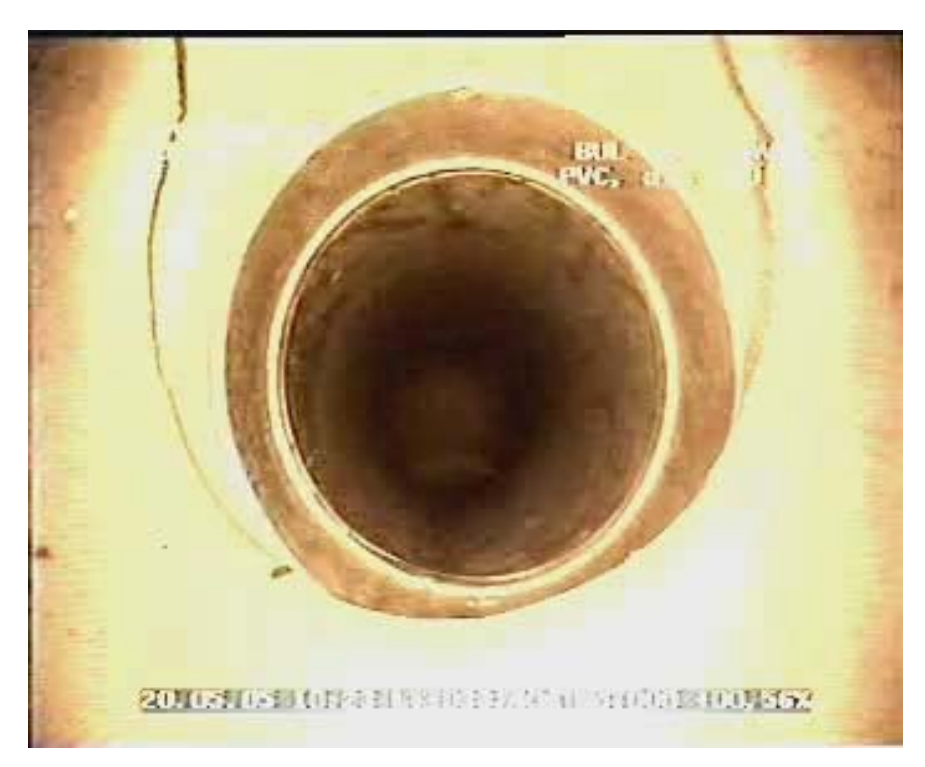
Fig. 1. Cracks in the wall of a PVC sewer main at a lateral joint due to uneven soil compaction and the lateral acting as a lever