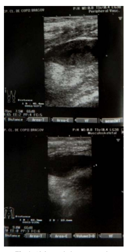
Fig. 1. Abdominal ultrasonography showing a collection in the right lower quadrant

The abdominal ultrasound scan revealed a hypo- echogenic intra-abdominal mass of 4 cm in diameter, situated 2 cm deep in the right iliac fossa, containing unhomogenous fluid (Figure 1) and absence of free fluid in the peritoneal cavity. Both kidneys presented enhanced reflectivity and showed no kidney pelvis dilation.