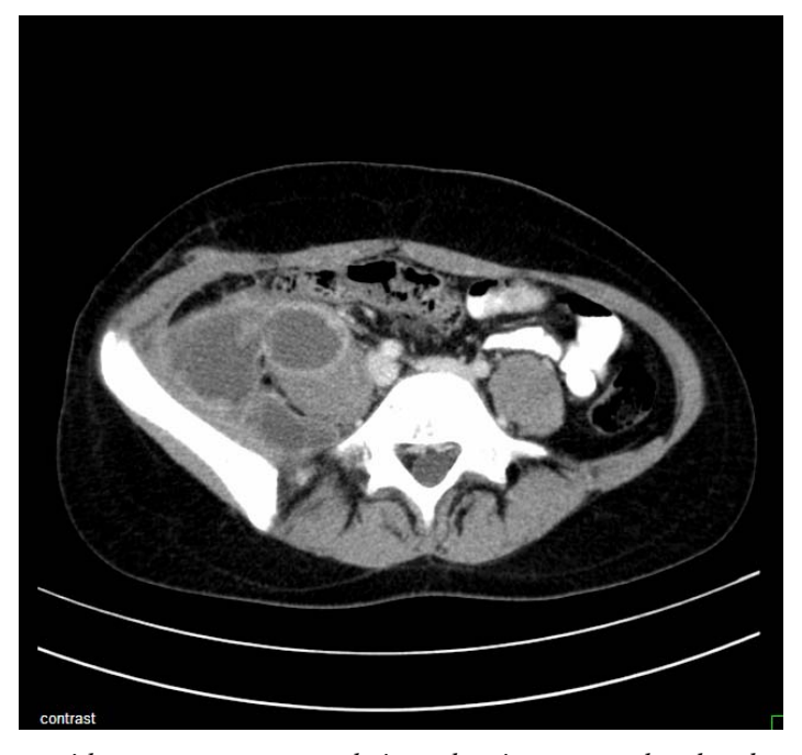
Fig. 4. CT scan with contrast, transversal view, showing a gross loculated retroperitoneal collection in the right flank, coming in contact with the iliopsoas muscle which is swollen.