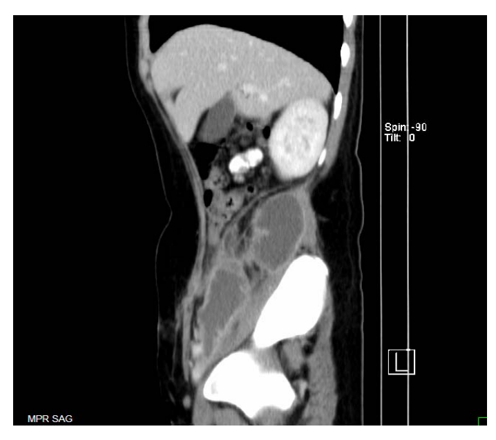
Fig. 3. CT scan with contrast, sagittal view, showing a gross loculated retroperitoneal collection in the right flank. The mass comes in contact with the iliopsoas muscle while extending cephalad to the inferior pole of the kidney and caudal to the deep inguinal ring.