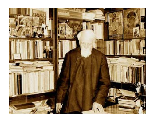
Fig. 4. Priest Dumitru Stăniloae

Maybe the profane culture and the Christian culture seem very different, but the Saint Fathers of the Orthodox Church said that the strongest scientifically power was the same thing with the soul's humility and purity" [4]. In conclusion, the internal power of the great culture comes from the spirituality, that invests the profound culture and art with unsuspected strengths.