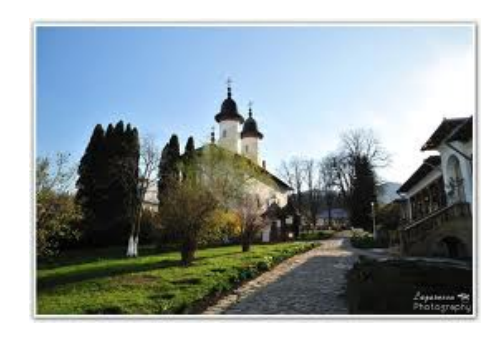
Fig. 2. Văratec Monastery (Neamt)

3. The idea of spiritual and cultural community of Romanian personalities, based on superior values: "at Varatec Monastery we had beautiful cultural meetings in the evening, we were listening to beautiful music..." [2, p. 64-65].