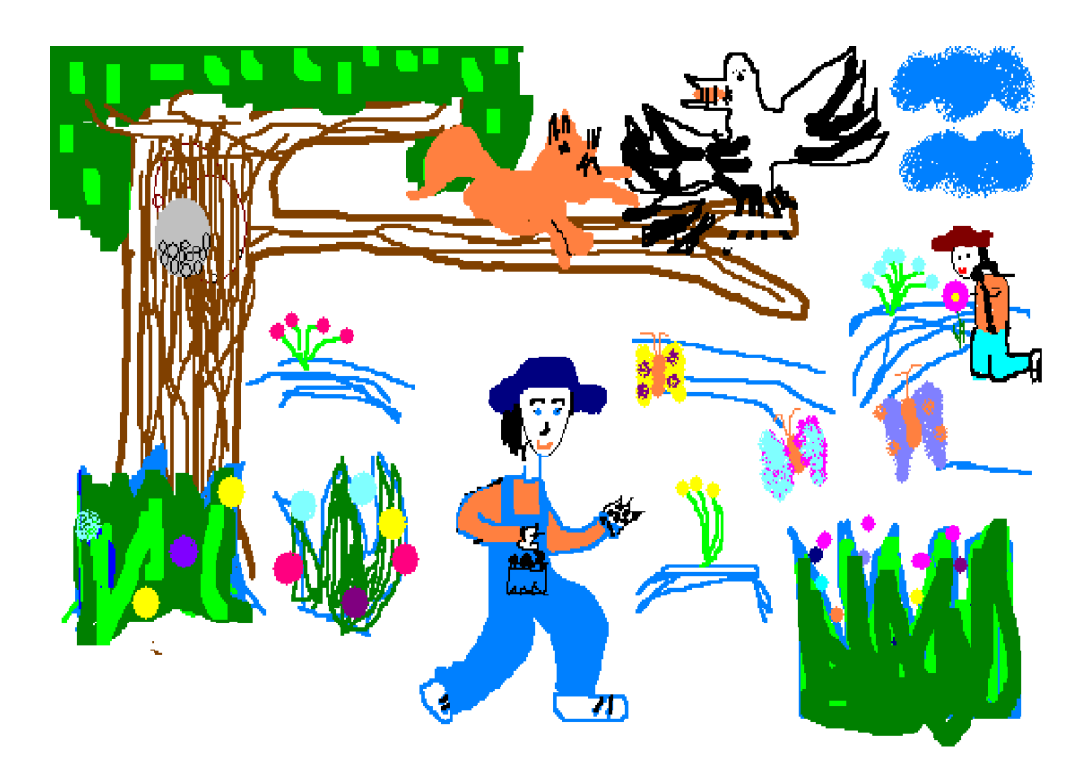
Fig. 1. The drawing handed in to the subjects

The questions included in the test had been actually drafted as suggestions [5].