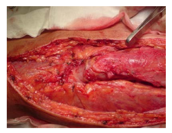
Fig. 4. Musculare graft end-to-end suture

Subsequently, the suture of the muscular graft was performed with separate non-absorbable sutures in the suprapatellar musculotendinous distal area (Fig. 4-5).