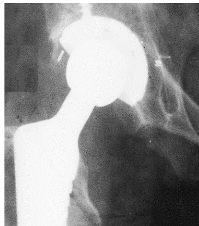
Fig. 1. Right hip X-ray showing the absence of heterotopic ossification.

Case 1. Female patient, 53 y.o, uncemented THR of the right hip, with the etiological diagnosis of primary coxarthrosis. The approach used was lateral. Harris Hip Score is very good (94 points). We notice the absence of heterotopic ossification. (Fig. 1)