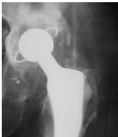
Fig. 3. Left hip X-ray showing 2 nd degree heterotopic ossification.

Case 3. Cemented THR of the left hip at a female patient of 63, with an etiological diagnosis of coxarthrosis secondary to congenital hip dislocation operated on at the age of 2. The approach used was Watson-Jones. Harris clinical score is good (80 points). We notice a 2nd degree heterotopic ossification. (Fig. 3)