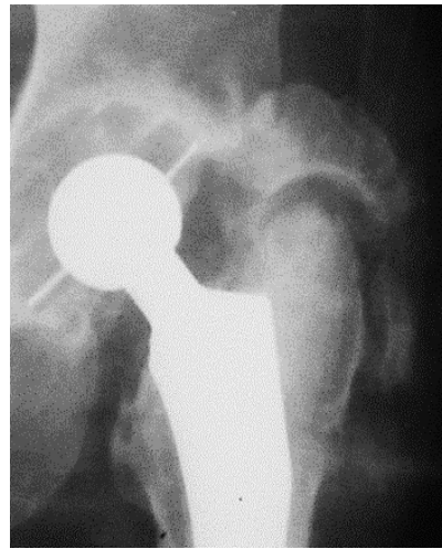
Fig. 4. Left hip X-ray showing 3 rd degree heterotopic ossification.

Case 4. Cemented THR of the left hip at a male patient of 60, with an etiological diagnosis of secondary coxarthrosis to avascular necrosis of the femoral head. Clinical score is very good (98 points). The approach used was Watson Jones. We notice a 3rd degree heterotopic ossification and a lack of correlation between Harris score and the high degree of heterotopic ossification. (Fig. 4)