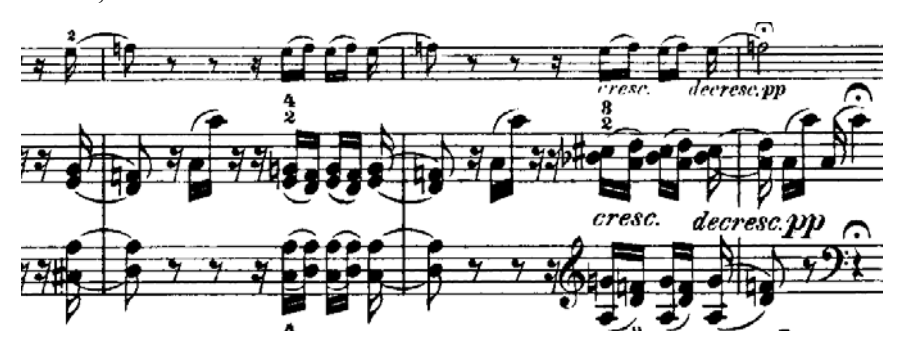
Movement I, m.37