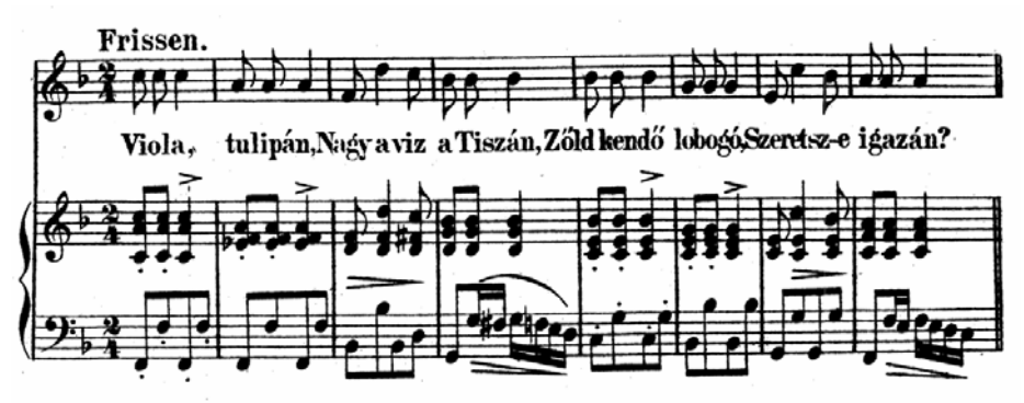
Fig. 3. Bartalus István's printed collection, vol. 2, 146

century.<sup>2</sup> Therefore its appear in the printed edition is not a novelty. However, the manuscript reveals that the tune was sung to Bartalus by a peasant girl from Dédes, a village of Northern territory (see Figure 2). The tune is the 80. one of the first volume of the manuscript, that is, it was transcribed at one of Bartalus' first field-works, thus it testifies the fast spread of popular tunes. Popular songs which were sung by peasants and appeared by Bartalus with data of field-work are considerable as sources for the research of connections of urban and peasant music, and they lighten the miscelleneous repertoire of peasants. The songs noted from the cited village, Dédes are examples of that phenomenon. Some tunes of the villages are noted from a 75 years old peasant woman who sang four old-style, descending tunes and a popular song (Bartalus n. d., Vol. 1. 74-77 and 83). But there are besides three descending melodies, three well-known popular dance tunes and three new style folk songs from the village in the manuscript with the mark 'after a peasant girl'(Bartalus n. d., Vol. 1. 78-82, 86-88 and 90). These data of partly different repertoire of generations are peculiarly interesting for historical ethnomusicology, for example from the point of view of the study of the new style Hungarian peasant song mentioned above, which was inspired by urban music of the second half of 19<sup>th</sup> century.