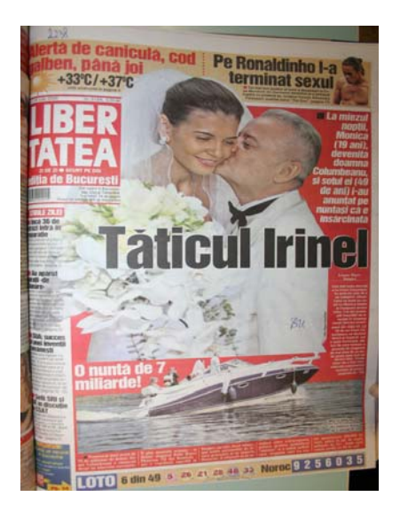
Fig. 2. Libertatea, July 24, 2006

The stories described by photos are exciting, dramatic and also shocking. Thereby, the newspaper is directly involved in the social issues of the time: "By publishing pictures of a fire, or a protest in the streets, the newspaper seems more connected to the present, strengthening the impression of its involvement as an active witness" (Preda, 2006, p. 130). "Due to the frequent reproduction of color images", wrote Jean-François Maurice Mouillaud and Tetu (2003, p. 86), "the real effect is getting more essential, the world show is, thus, more likely". In case of pictures both with and without text (Fig. 2 and 3), the legend is needed, giving readers a (usually) short explanation. Photos also have got to create sensation in the journalistic discourses, as well as in contemporary texts, it has continued to be "the primary means of representation of news" (Becker, 2004, p. 141).