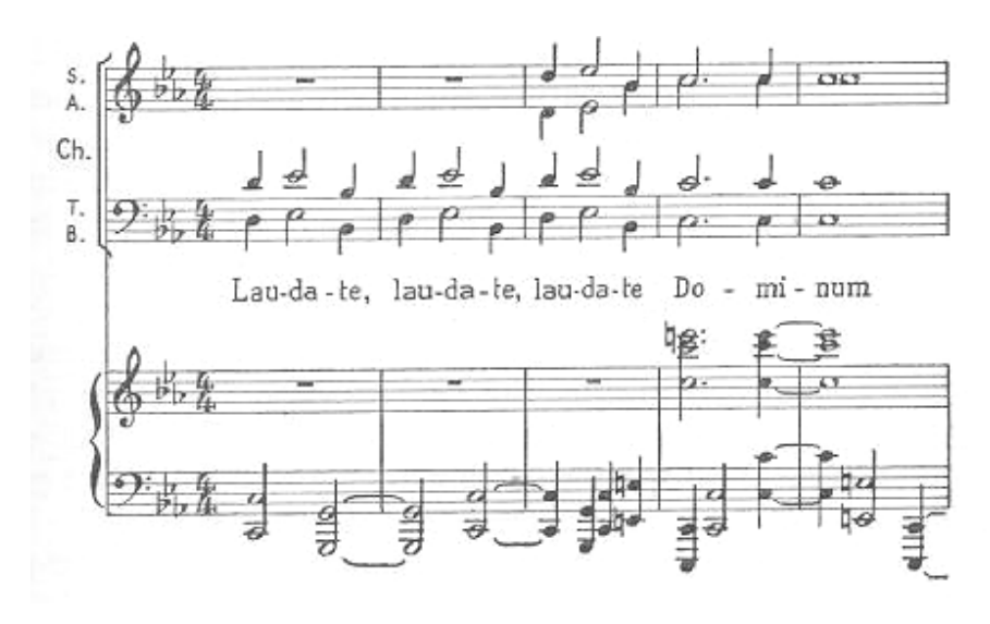
Fig. 3. Musical fragment from the third movement of the symphony (Psalm 150)

Although this religious creation reflects personal religious experiences, it also represents a universal expression of the religiousness of a community in collective prayer. Composed to celebrate 50 years from the creation of the Boston Symphonic Orchestra, the score of the symphony fulfilled both the expectations of the instrumental ensemble to perform a symphonic piece, but also Stravinsky's wish to publish a composition appreciated by the public.