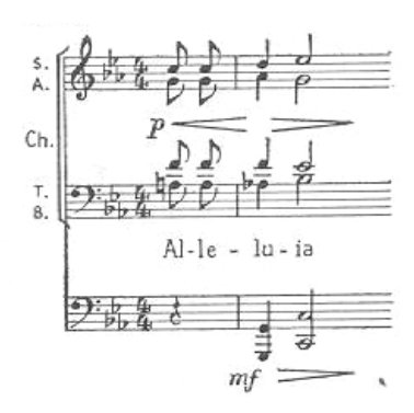
Fig. 5. Motif from the third movement of the symphony

Stravinsky explains his choice of psalm 150 by the fact that it is a popular one among church goers but also among composers; his wish was to compose music suitable for the atmosphere of David's Psalms, in contrast to the common musical representations of the psalms in a lyrical sentimental fashion. In the composer's opinion, the psalms express exaltation, anger, fear of judgement, and can turn into curses (Stravinsky and Craft 1963, 44) . "The finale, the familiar Psalm 150, is a call to praise the Lord with the sounds of trumpet, psaltery, harp and timbrel, and with dance. Stravinsky's music of praise is tinged with mystery, awe and fear. Indeed, the simple, recurring three-chord setting of the word "alleluia" is surely the most sadly beautiful harmonization of this timeless word" (Tommasini, 2003).