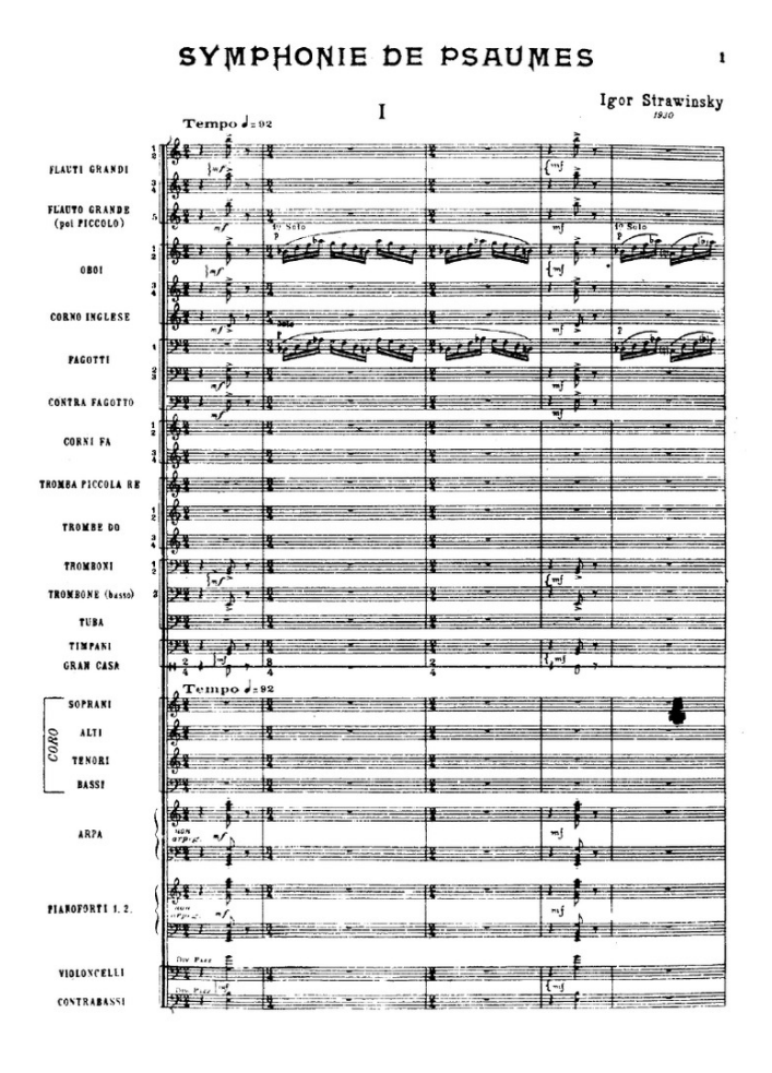
Fig.2. Musical fragment from the first part of the symphony

religious music, "by using a form of psalmody, a chant with limited ambitus, in the spirit of the Gregorian music, by exploiting church modes and the Latin language" (Larousse) (our translation). The composer's intimate religious feelings are present in his entire vocal-symphonic creation. The lyrics of the psalms chosen by Stravinsky underline his predilection for the complexity of human religious feelings, his musical creations being based on psalms 38, 39 and 150: "for the text of this Symphony, Stravinsky selected from the Vulgate verses 13 and 14 of Psalm 38, verses 2, 3 and 4 of Psalm 39 and the whole of Psalm 150" (White). "Stravinsky scored the piece for unconventional musical forces - a big contingent of woodwinds, brass and percussion, plus low strings, two pianos and harp. Clarinets, violins and violas are notably missing" (Baker, 2012).