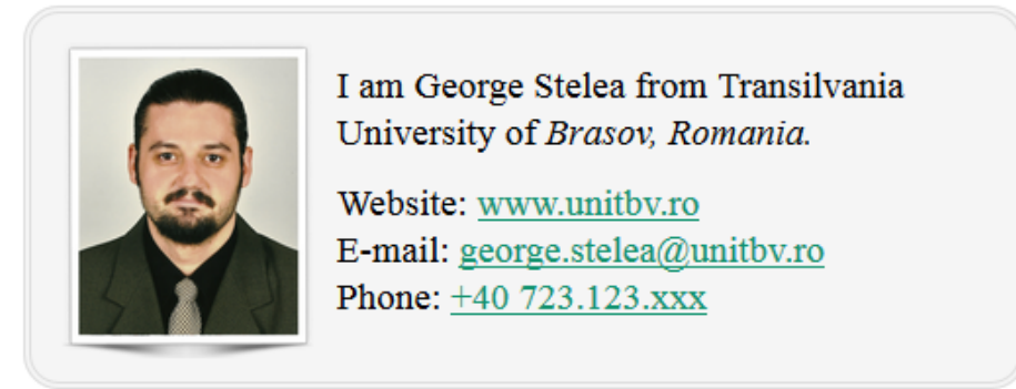
Fig. 3. Front-end view of the HTML block item

Figure 3 presents the front-end view of the HTML block item, which is displayed in the web browser when a user visualizes and interacts with the web application.