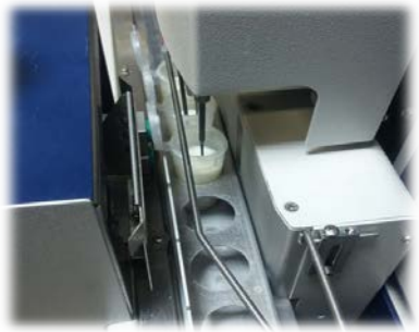
Fig. 3. The Fassomatic F.C. equipment used to count the somatic cells from the milk (NSC)

The functioning principle of the Fassomatic F.C. equipment is based on marking somatic cells with a fluorescent dye (ethidium bromide), process after which they are electronically counted. The somatic cells are exposed to light with a