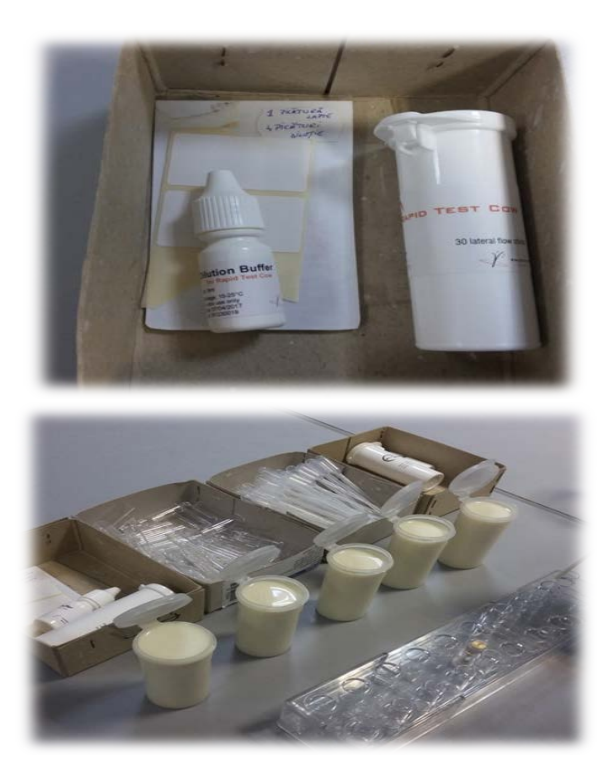
Fig. 5. Equipment used on the research of sheep milk falsification level

It is stated a falsification percentage of 20% of the goat milk with the cow milk, when it comes to the milk coming from mixed farms for animal growth and exploitation of goats.