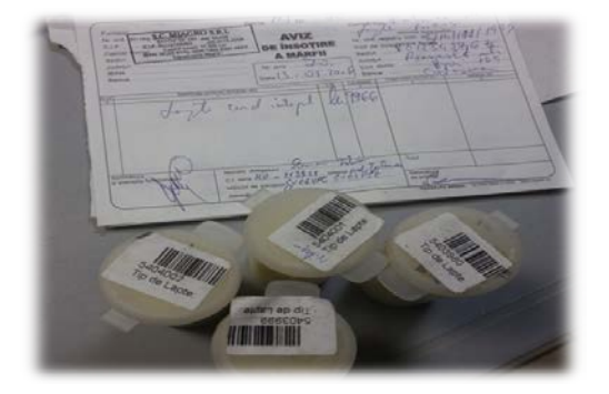
Fig. 1. Milk samples drawn for qualitative analyses

On the glass it is also written the type of milk and the provenient compartiment, respectively the place of origin (Figure 1).