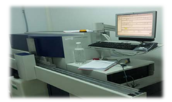
Fig. 2. General view on the equipment used for determining the total bacteria count of the milk

For this analysis is used the first drawn sample from each compartment of the tanks, respectively the one without stirring of the milk, the research equipment type being Bactosan, whose principal functioning principle is based on flow cytometry (Figure 2).