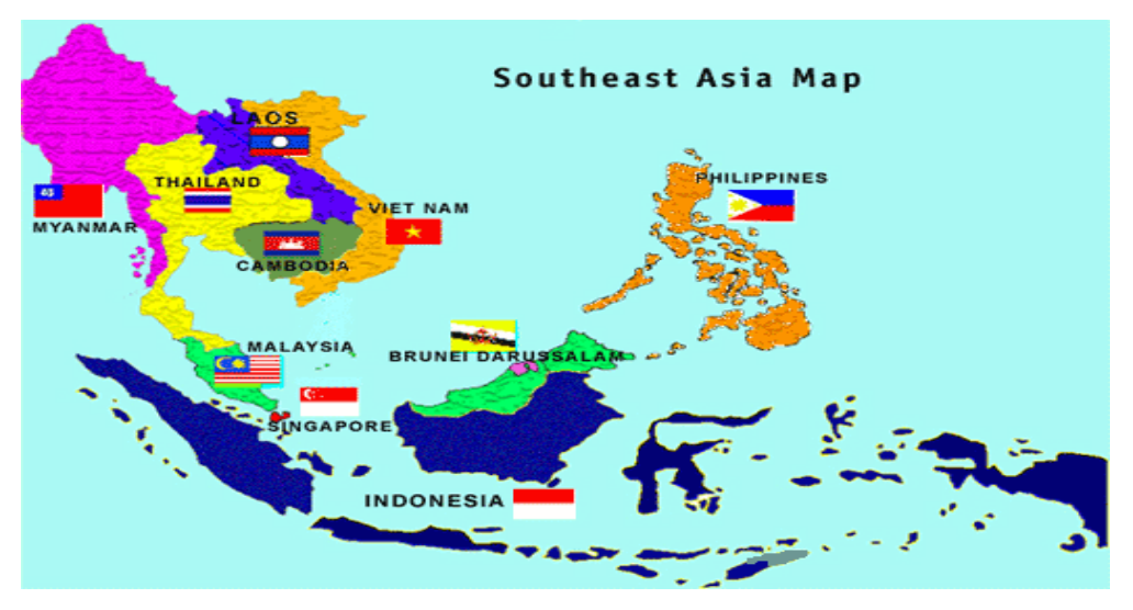
Figure 1. The Countries of ASEAN

The history, unique and interesting to each country, has changed somewhat over time with geopolitical and sociocultural conditions and analytical trends, according to Kondratas et al. (2015, 9), and cannot be distinguished from the present, basing upon a deeper understanding of the past, according to Houben (2014, 28). Taken various modalities, according to Kelertas (2006, 28-29), colonial domination depicts different-important facts of colonial empires, needs, strategies, trajectories of expansion or contraction, and levels of territorial penetration, control and exploration. Said (1993) notably argues some areas—the Middle East and China were not colonized, but were more affected by "colonialism" than many countries that were. Some countries-Ghana, Nigeria or Senegal-were relatively swift and generally peaceful, but others-Algeria, Kenya, Mozambique or Vietnam-were protracted, vicious, and bloody (Kelertas 2006, 28-29). Houben (2014, 29) identifies Southeastern Asia as the area between India and China (Figure 1), as a military strategic concept during the Second World War for almost seventy years, and as an endeavor of the studies research and a successor to the European tradition of studying their own-colonies, in the era of the Cold War from the 1950s.