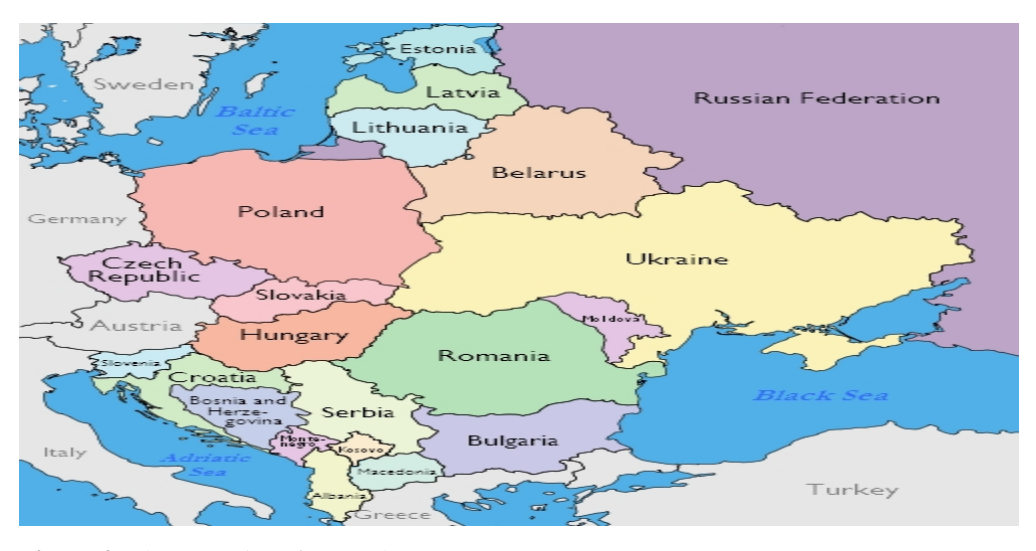
Figure 2. The countries of Central Eastern Europe

scholars recognize that Soviet Russia or the USSR is not construed as an empire, but only "Soviet imperialism", except the US during the Cold War, as Andreescu (2011, 58) in Are We All Post-colonialists Now? writes "Postcolonial Studies scholars have traditionally paid little attention to Soviet Russia and its Central and Eastern European satellites." In the 20<sup>th</sup> century Russia acknowledges only old "capitalist" empires— England, Germany, Spain, France, Holland, and Portugal—as colonizers, without looking at itself as a colonial empire, according to Kelertas (2006, 1).