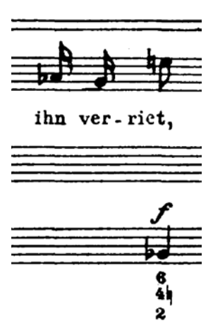
Fig. 9. Increases fourth