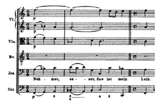
Fig. 3. The bread theme, bars 20-21

The presence of the same theme, Jesus voice, in the bars 25 and 26 contributes to the dialectical unity. Because of rhetorical consideration this time we have only slightly modified theme which is in C major tone.