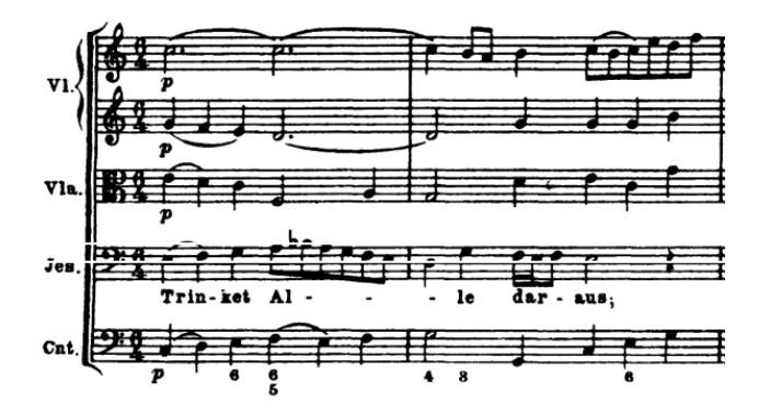
Fig. 4. The wort theme, bars 25, 26

It is obviously the similarity of the two motives for the listener and it becomes more compelling dogmatic unity of the body of Jesus that breaks, to feed and His blood, which make atonement (fig. 4).