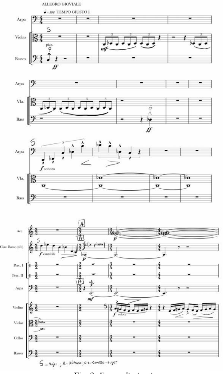
Fig. 3. Fugue dissipative