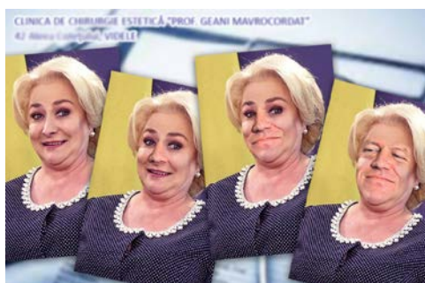
Figure 3. Meme in timesnewroman.ro

Another important difference between classic cartoons and memes is the decontextualization - recontextualization process. As mentioned above, memes are the result of two or three images, overlapped, in order to create a meaning. This process of taking a picture from one place and paste it on top of another picture involves decontextualization - cutting a picture from its initial context - and recontextualization - paste it into another context, usually, when talking about humor, a totally different one. I found this process extremely important for the creation of humor in memes, as usually these exact opposed contexts are the ones to create humor through following the script opposition.