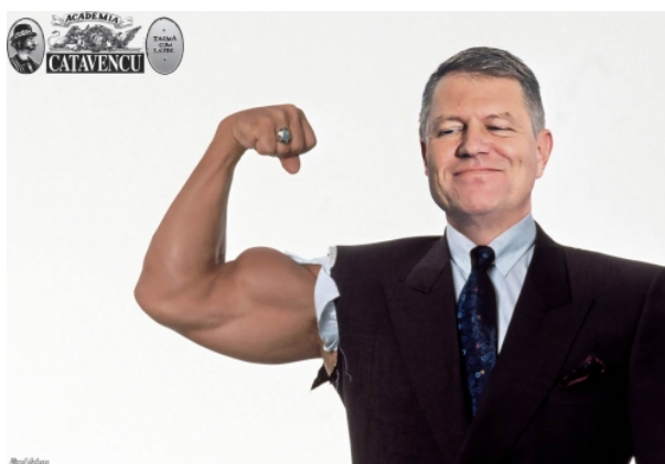
Figure 7. Meme in academiacatavencu.ro

As mentioned in the beginning of this article, most of the memes are used in satirical news along with a full text/satirical news, while political cartoons can carry a strong message per se , with small texts in captions or balloons. Political cartoons, as most of the times are addressing complex political or social-political facts, must give the reader some extra information, this way making sure the message will be correctly interpreted, thus, the humour will be effective. Hence, in memes, texts are not inserted in the image, because the image is just a part of the whole news , meanwhile cartoons are the actual news , with some extra information in balloons or captions.