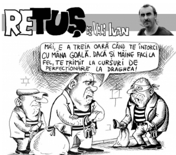
Figure 8. Cartoon in academiakatavencu.ro

Political cartoons, instead, come up with dialogues, normally in balloons. This method is very old and has become a symbol of cartoons during time. Just like balloons, captions are used by satirical journalists to guide their readers towards their intended message. Both balloons and captions help the reader identify the characters, if they are not so recognizable, the political or social event they are targeting, or simply their perspective on it. This is also because memes use real photos of the targets/politicians, but cartoons work with what the cartoonists are creating, thus, the chances for their characters to be unrecognizable and the message to be confusing is bigger.