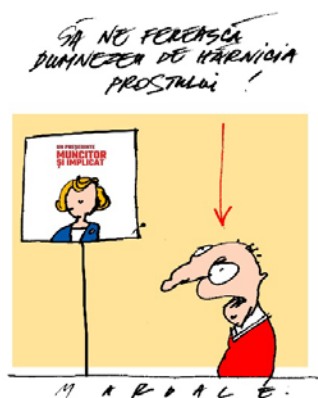
Figure 1. Poster in catavencii.ro

During 2019's runoff presidential electoral campaign, most of the attention went on former prime-minister Viorica Dăncilă, who ran for president along chief of state Klaus Iohannis. During her prime-minister mandate, she did many grammar mistakes or inappropriate gestures during official visits or press conferences, therefore she was characterized as unexperienced or even silly by many people, particularly Internet users. She then became the target of many bad jokes highlighting how Romania will be ruined if she will ever be elected. Viorica Dăncilă entered the Romanian political scene quite suddenly, in 2018, when she was proposed as prime-minister by the Social Democratic Party, becoming the first Romanian women to ever have such position. From the very beginning, Dăncilă got the attention of both national and international media due to her bad grammar, which turned her into satirists and caricaturists' source and target of humour.