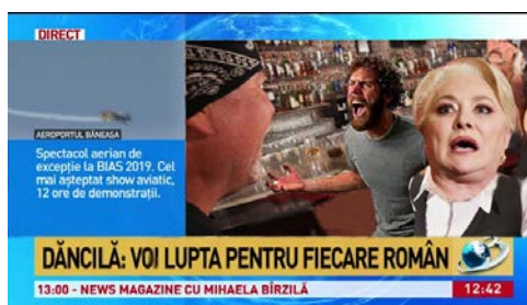
Figure 2. Meme in timesnewroman.ro