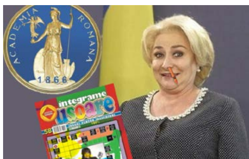
Figure 4. Meme in timesnewroman.ro