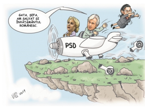
Figure 6. Cartoon in academiacatavencu.ro

In Figures 3, 4 and 5 , the satirists have taken the picture with the former prime-minister's face and pasted it on three different images and three different contexts to highlight her lack of experience for the position she held, by pasting her face on top of pictures representing contexts she would better fit in: Photoshop activities, crossword puzzles or Disneyland. All these memes have emerged during the 2019