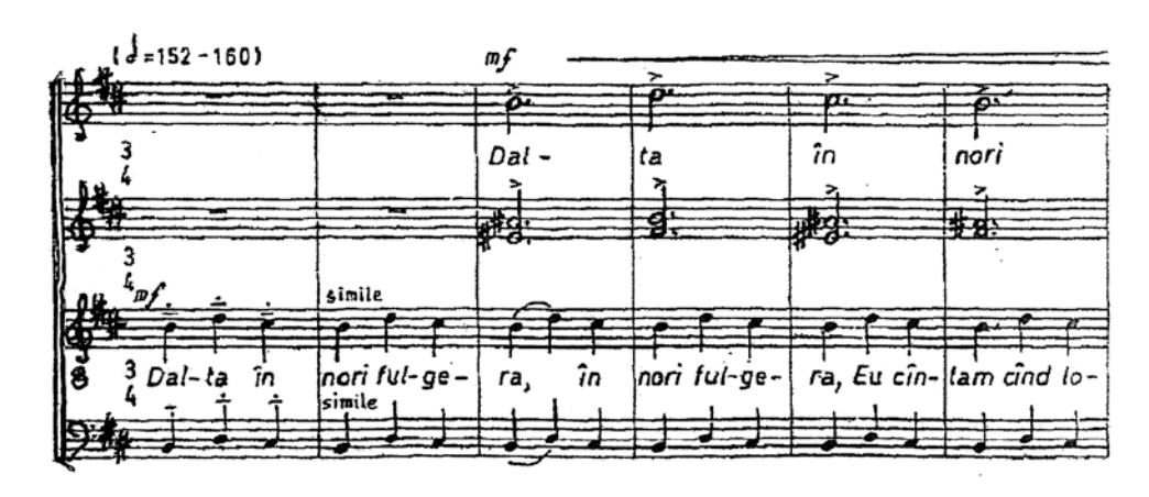
Ex. 7. The motivating cell of the second part

The theme is interpreted in octaves parallel with the tenor and bass parties. It is a motivic cell of three sounds formed on a small third of the tonic: