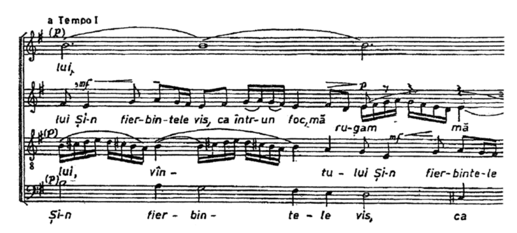
Ex. 4. The second theme

Şi-n fierbintele vis, ca într-un foc, mă rugam In the hot dream, as in a fire, I pray