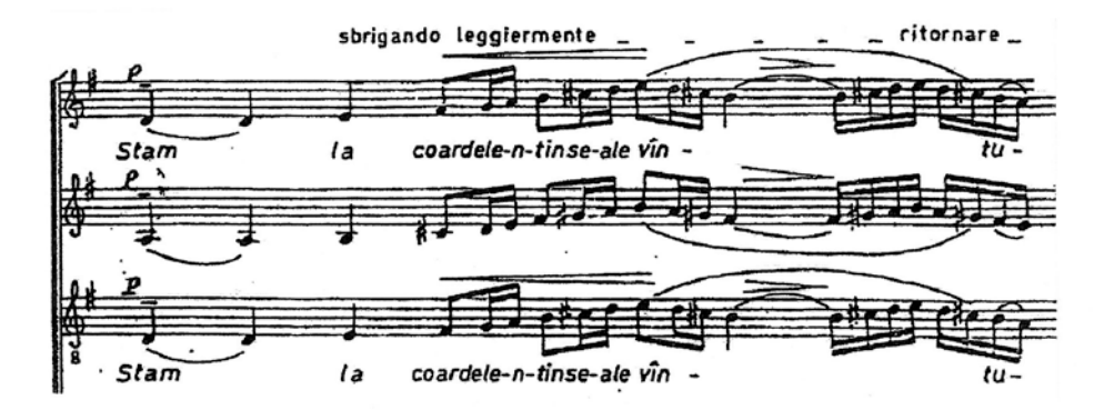
Ex. 3. The link to the second thematic idea

The link to the second thematic idea requires another facet of the composite vision (p. 2, system 1 - Ex. 3)