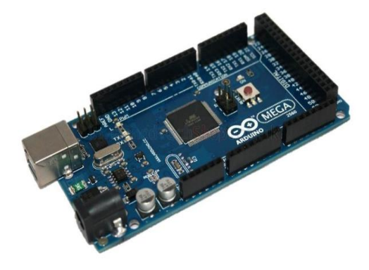
Fig.7. Arduino Mega 2560 [10]

(DMPS/MAS) forming the drive system of the orthosis.