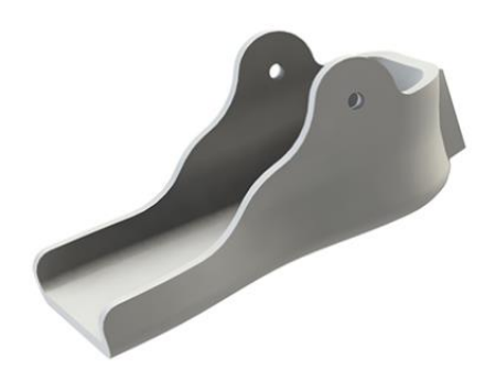
Fig.4. CAD model of the bottom part of orthosis