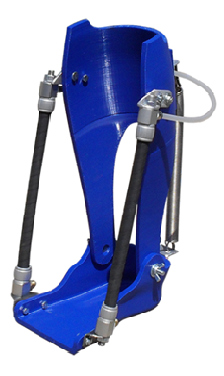
Fig.6. Orthosis activity on a 3D printer with mounted pneumatic muscles