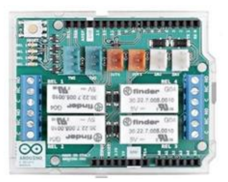
Fig.8. Module with 4 relays [11]

This microcontroller represents the control system and makes the connection with a pressure sensor that is placed on the foot orthoses and a module with 4 relays (Fig.8) which represents the connection between control system and pneumatic system. The pressure sensor will provide the data which will be analysed of the microcontroller. After that. the microcontroller will command the Module with 4 relays (Fig.8) which is connected with a Solenoid Valve 3/2 Way [13] who will late the gas pass through pneumatic system.