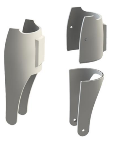
Fig.3. CAD model of the upper part of orthosis

The first step to accomplish the active orthoses was the realization of the CAD model. The CAD model was realized with the software SolidWorks (Fig.3). Because the physical realization of the orthosis was based on 3D printing with PLA, the model had to be adapted size 3D printer. Platform dimensions are 20x20x20 cm printer used, in this case the upper part of the orthosis had divided itself in two sides, top and bottom, which are assembled like a puzzle piece (Fig. 3 and Fig. 4). Completing the model predicted the formation of holes in the sides of the orthosis to the lower joints of the orthosis by screws.