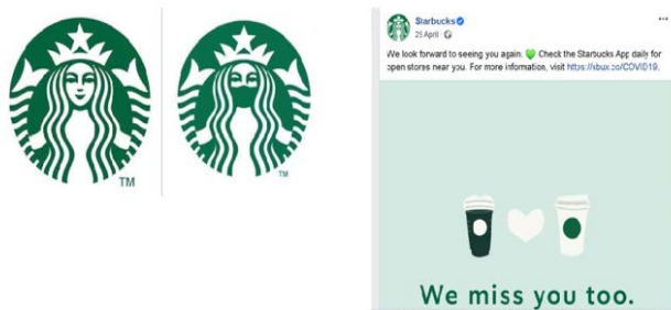
Figure 6. Starbucks new pandemic logo

Starbucks go with the message: „Check in with each other. We'll get through this together”, referring to one of the social networks' functions, that of checking in, but this the check-in is no longer at the visited place but at home, and not tied to a place but rather to other persons we interact with online, as long as there are movement restrictions. In March, Starbucks transmitted a multitude of messages: through images (mask on the face) or by the texts associated to images: „Good things are still happening. We see stories of our customers and partners (employees) going the extra mile every day, but during this time these little acts of kindness shine even brighter” (25.03.2020, Facebook).