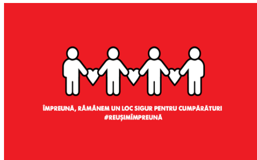
Figure 5. Mega Image new brand logo

heart, which makes us think of unity through emotions, by maintaining social distancing. The change is quite big and the intent of Mega Image is to convey the idea that people are at the heart of this change and it is still them that can go through this crisis together.