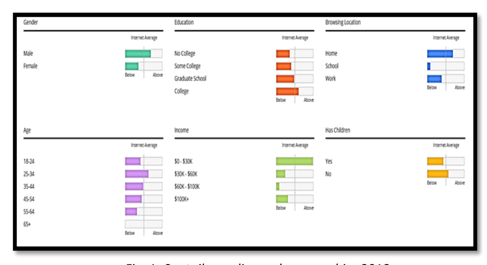
Fig. 1. Sputnik - audience demographics 2018

As shown in Figure 1, we have insights on gender, education, income and age of the target website's audience, helping us to identify key characteristics about Sputnik readers.