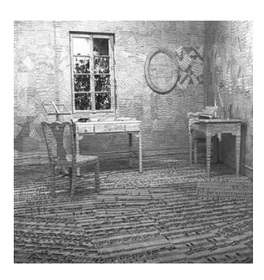
Fig. 2. Ludwig Van (1970) film by Mauricio Kagel

The musical work appears in a special historical and social context which regards the attitude towards tradition, the anti-authoritarian movement of the 1960s and 1970s, and its impact on avant-garde composers, Beethoven being considered a symbol of the past. Indeterminacy and experimentalism were two of the tendencies which Kagel combined in his creations: the indeterminacy of the musical score raises special difficulties in its interpretations (it is not only a propagator of the initial message of the composition, but also a factor determining the quality and the content of the message itself).