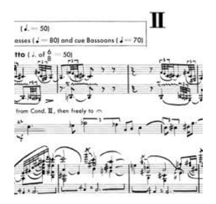
Fig. 1. Kocher, Ph., Retrinking open Form, 19th Generative Art Conference, Florence, 2016

Karlheinz Stockhausen (1928 – 2007) was one of the most visionary musical creators of the second half of the 20<sup>th</sup> century, benefitting from the evolution of the techniques for manipulating the sound through electronic means. Equally sanctioned and contested, he was among the first to apply electronic techniques to music, also introducing elements of randomness in serial composition, and promoting the concept of sonorous spatiality. The electronic composition was practiced in both his versions, with or without live performance, and after 1950 the idea of sonorous spatiality, as it can be noted in the following compositions.