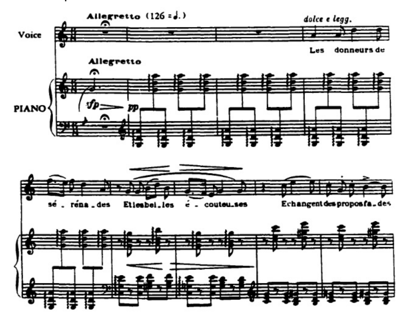
Ex. 3. Claude Debussy – «Mandoline», bars 1-9

From Mandoline, a mélodie by Debussy. «Les donneurs de serenades» becomes « Le do neu rde sé ré na de » (The men serenading). This piece has a quicker tempo from the previous two examples, yet the same presentation of elongated vowels pertains.